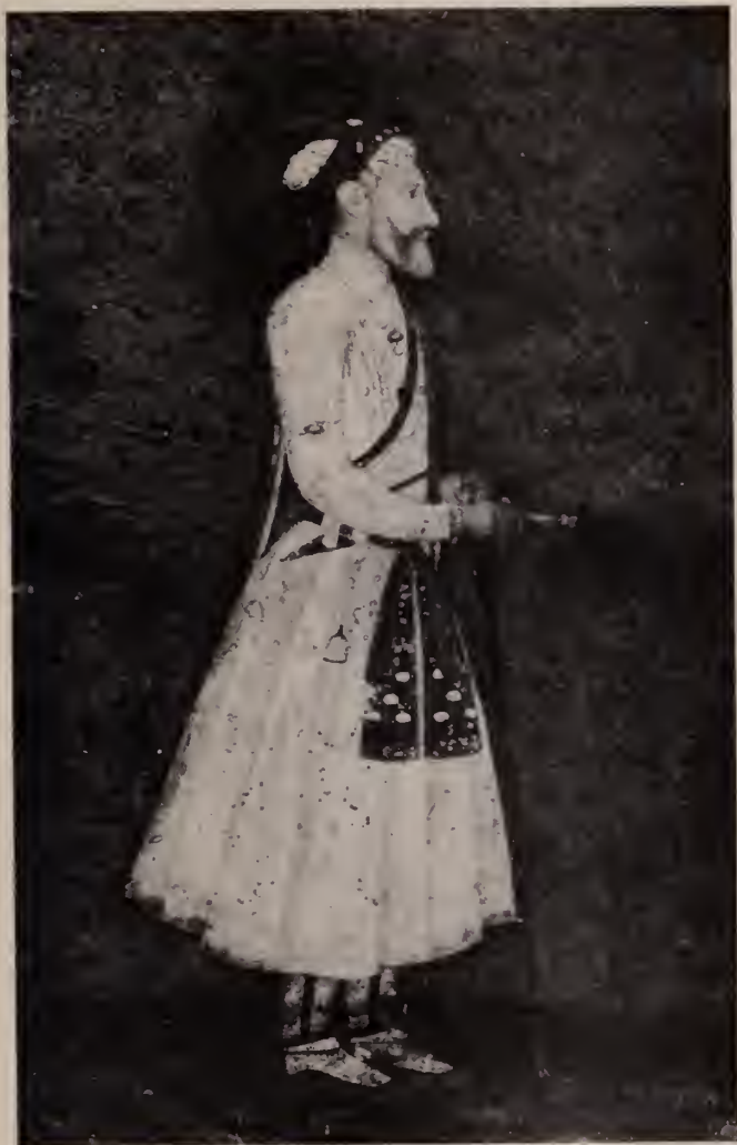
MOGUL PORTRAIT, THE EMPEROR SHAH JEHAN (SEVENTEENTH CENTURY).